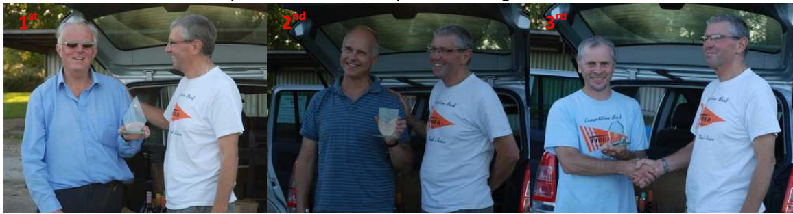
22 nd September 2013 Darley Moor Vintage Combat Finalists