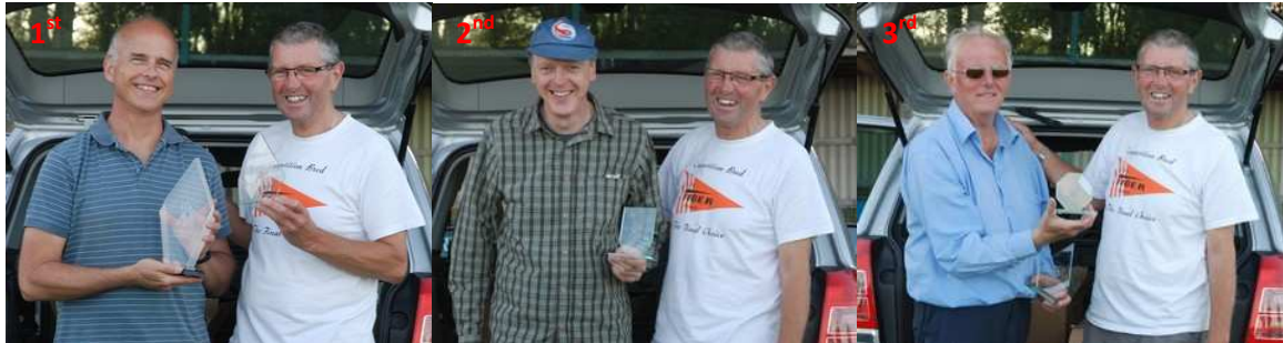
2013 Vintage Combat League Top Three